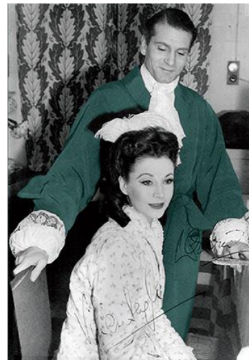
An autographed photograph of Laurence Olivier and Vivien Leigh in the Theatre Royal dressing room, Hobart, 1948.