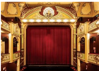
The Theatre Royal stage.